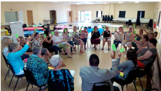
CSN workshop in Sydney Sept 17 & 18, 2015

The collectively-developed draft action plans support the key action areas of coordinated counselling and support, visibility, navigation, and safer spaces & non-judgmental services. These action areas developed out of what was heard from communities in the first year of the strategy.